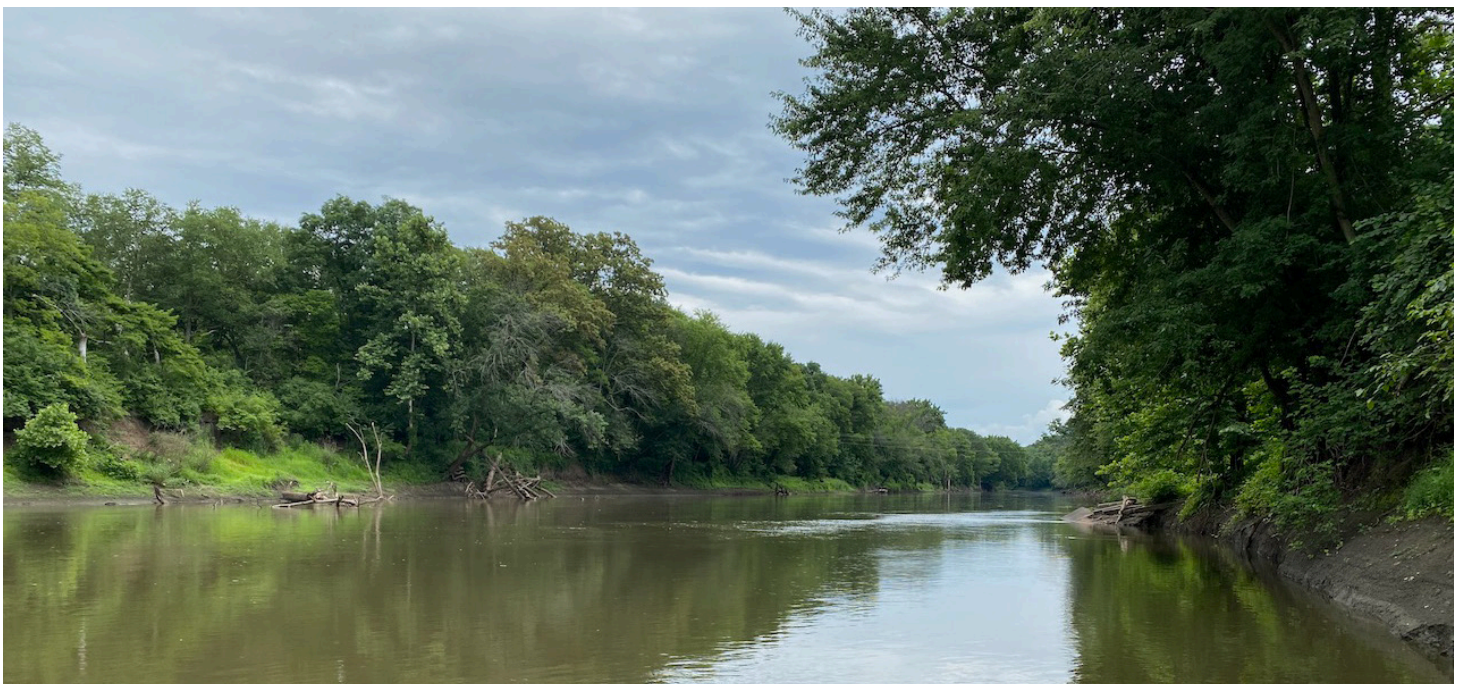
Sangamon River at New Salem State Historic Site boat ramp

The Committee prepares a slate of nominees for the board positions to be presented at the last monthly meeting of the fiscal year.