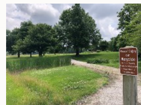
Wayside Park offers travelers and wildlife a peaceful respite.

Menard County Trails & Greenways maintains Wayside Park, a 2-acre Illinois DOT right-of-way at the SW corner of IL 97 & IL 123 south of Petersburg. The site hosts historic trees, a Council Circle surrounded by a prairie planting, and interpretive signs. Volunteers keep the site mowed, trimmed, and free of litter.