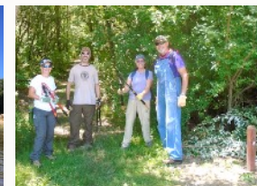
Volunteers perform trail maintenance at New Salem.