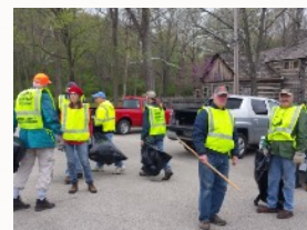
Volunteers work to keep IL 97 litter-free.

On Earth Day we partner with other like-minded civic groups to rid litter from our parks and greenways.