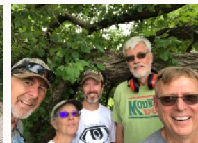
Volunteering is a great way to meet new people.