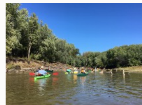
MCTG members enjoy floating on the Sangamon.

Menard County Trails & Greenways envisions a county-wide network of safe trails for walking and bicycling. We work in partnership with IDNR, Menard County, and Petersburg to improve and maintain existing trails. We actively advocate to expand opportunities for additional trails and trail connections. We also support the Lincoln Heritage Canoe Trail designation on the Sangamon River.