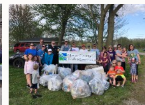
Volunteers pitch in to keep our parks litter-free.